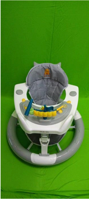
Front All Models.