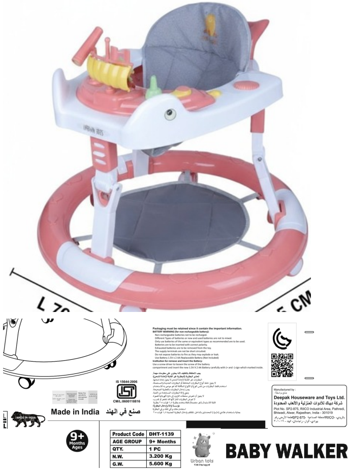
Front All Models.