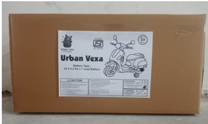
Packaging All Models.

هذه شهادة إلكترونية لا تحتاج لتوقيع أو ختم، امسح رمز الاستجابة السريعة للتحقق من الشهادة. This electronically generated certificate is valid without stamp and signature. Scan the QR code to verify this document.