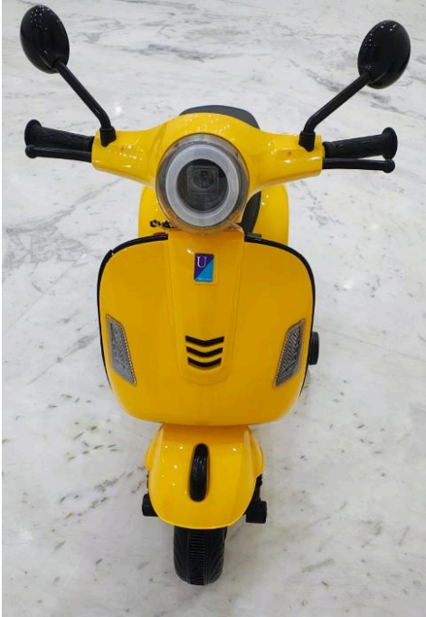
Front All Models.

هذه شهادة إلكترونية لا تحتاج لتوقيع أو ختم، امسح رمز الاستجابة السريعة للتحقق من الشهادة. This electronically generated certificate is valid without stamp and signature. Scan the QR code to verify this document.