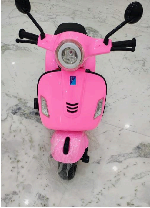
Front All Models.